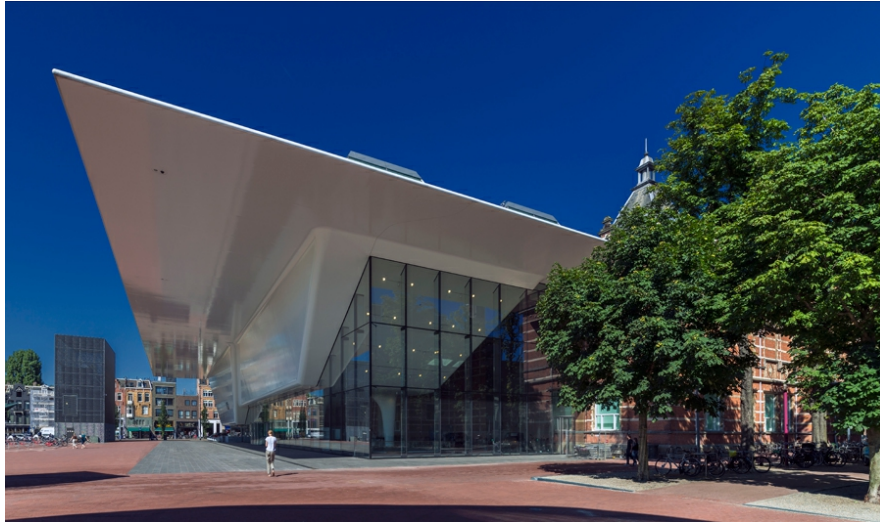
The cantilevered roof of the Stedelijk Museum addition.

Queen Beatrix of the Netherlands will preside over the building's opening ceremony on September 22.